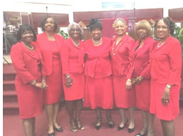
(left) Church service at Lewis Chapel Baptist Church, May 21, 2017

Our monthly meetings are held on the first Thursday of each month at North Regional Library, Fayetteville, NC