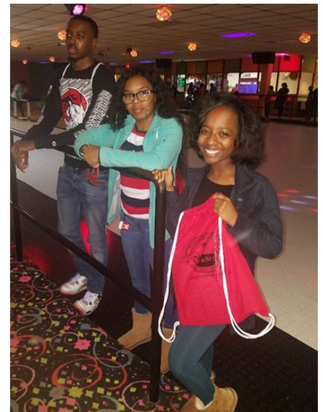
Figure 2: Current WSSU enjoyed an afternoon with "future RAMS".

After enjoying an afternoon of skating and refreshments, the students were presented with WSSU Ram backpacks filled with school supplies and other prizes.