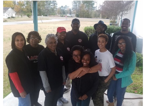
Figure 1: Duplin-Sampson chapter members and current WSSU students stop for a group picture.

The event was held to encourage students to value education and to acquaint them (their parents and the community) with the opportunities afforded them at Winston-Salem State University.