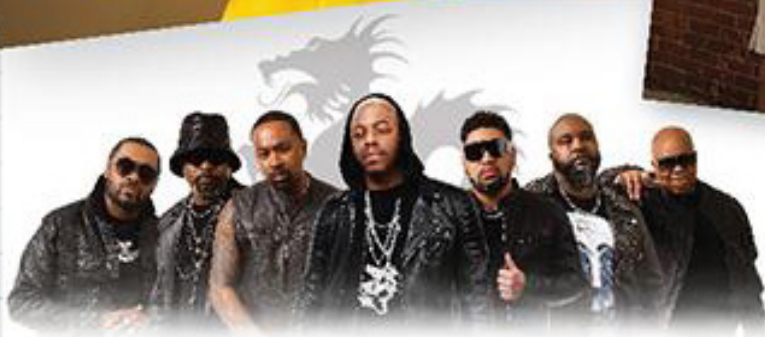
SCOLA NOKIO TAO SISQO SMOKE BLACK JAZZ